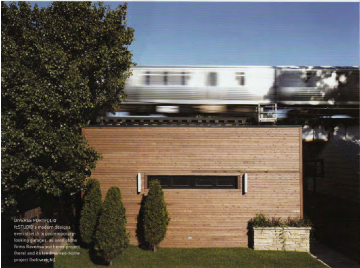
DIVERSE PORTFOLIO fcSTUDIO's modern designs even stretch to contemporary-looking garages, as seen at the firm's Ravenswood home project (here) and its landmarked-home project (below right).

dream clients—the ones who not only present us with a challenge, but also trust us with their project.”