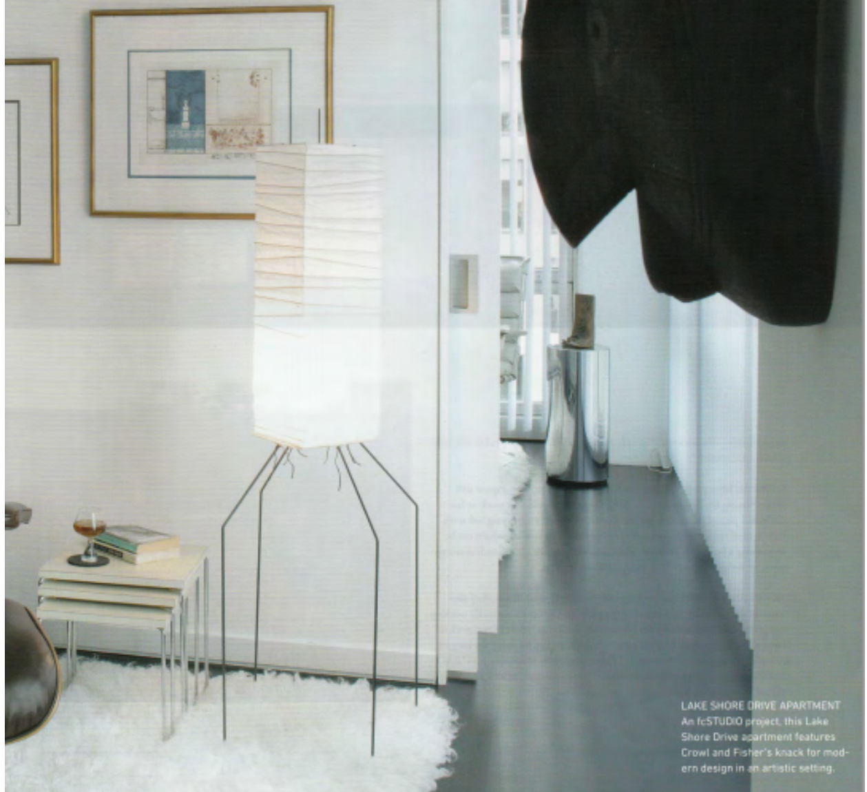
LAKE SHORE DRIVE APARTMENT An fcSTUDIO project, this Lake Shore Drive apartment features Crowl and Fisher's knack for modern design in an artistic setting.

"We have an unbelievable level of trust and respect when it comes to working with our clients. They find us not only accessible and responsive, but we're able to translate their thoughts and vision into spaces that exceed their expectations." JULIE FISHER, PARTNER & ARCHITECT