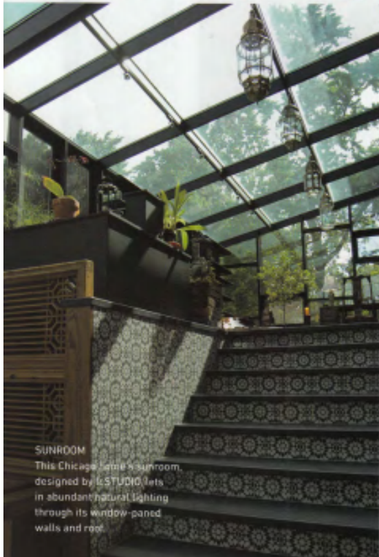
SUNROOM This Chicago home's sunroom, designed by f-STUDIO, lets in abundant natural lighting through its window-paned walls and roof.

In fact, clients have left other architecture firms to work with f-STUDIO because the duo is so easy to work with and makes them feel more comfortable with the process. "We have an unbelievable level of trust and respect when it comes to working with our clients," Fisher says. "They find us not only accessible and responsive, but we're able to translate their thoughts and vision into spaces that exceed their expectations."